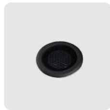
Cluster Inground Uplight 7W Textured Black Lien Huong Store